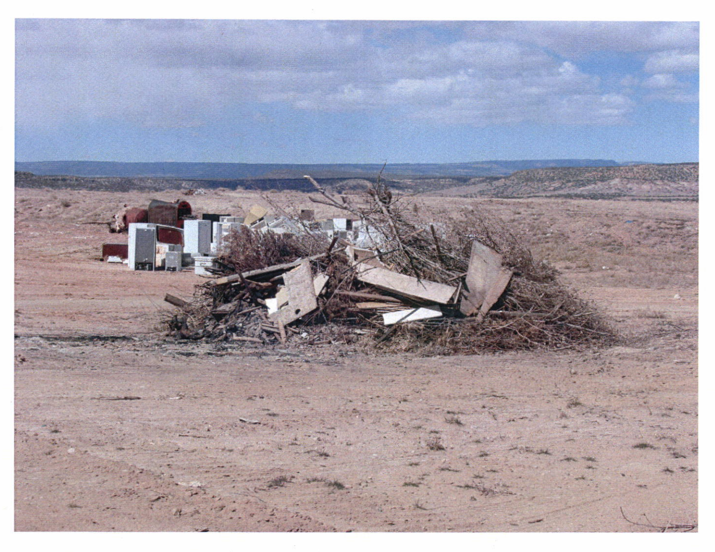
Looking northwest at the green waste pile