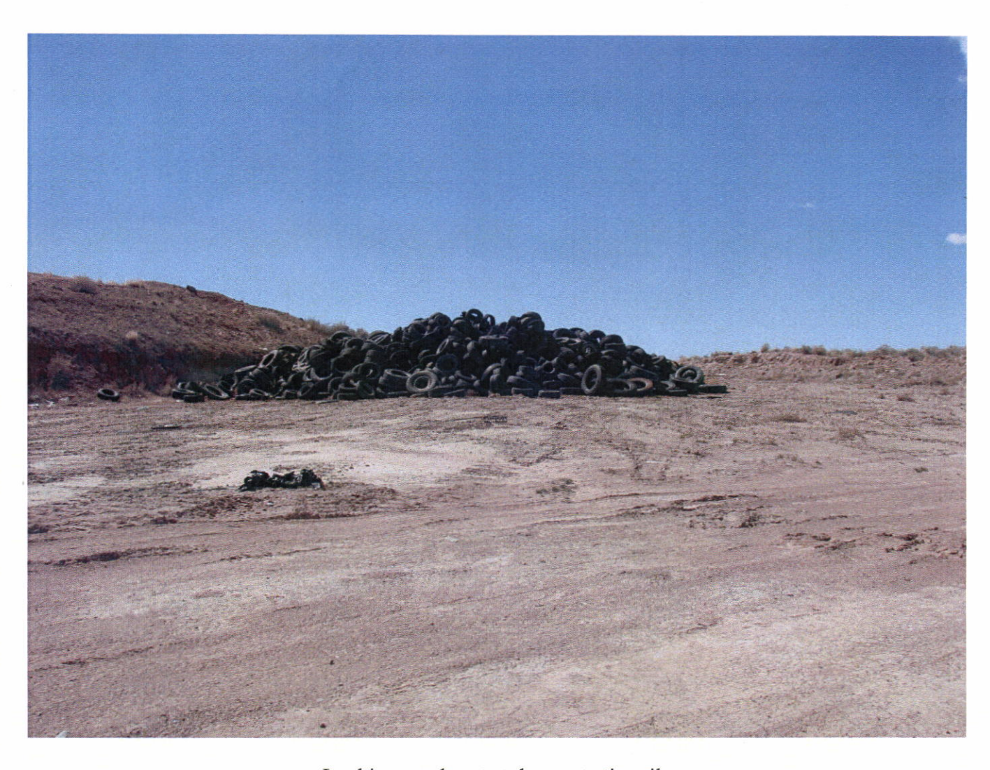
Looking southeast at the waste tire pile