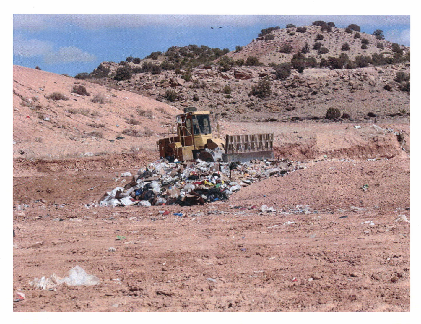
Looking north at the working face of the MSW landfill cell