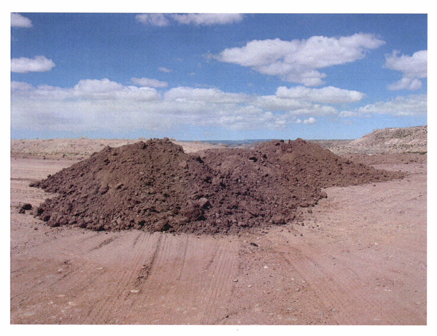
Petroleum contaminated soils. The soils are spread out on this pad and used as alternative daily soil cover for the landfill.