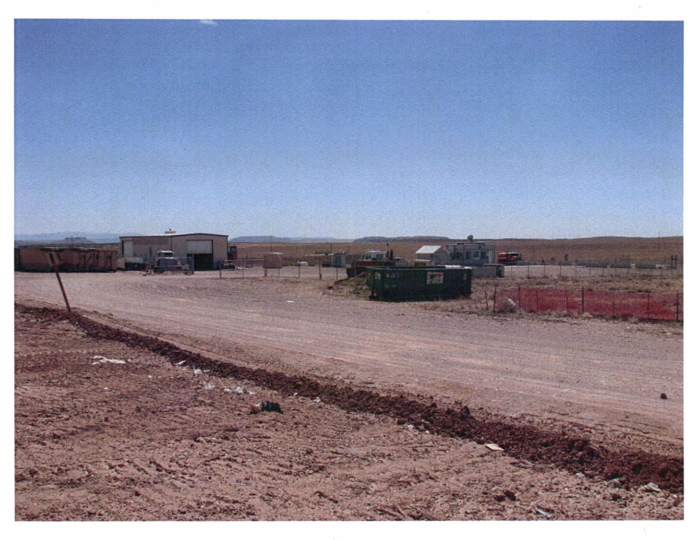
Looking southeast at the scale house and work shop of the landfill