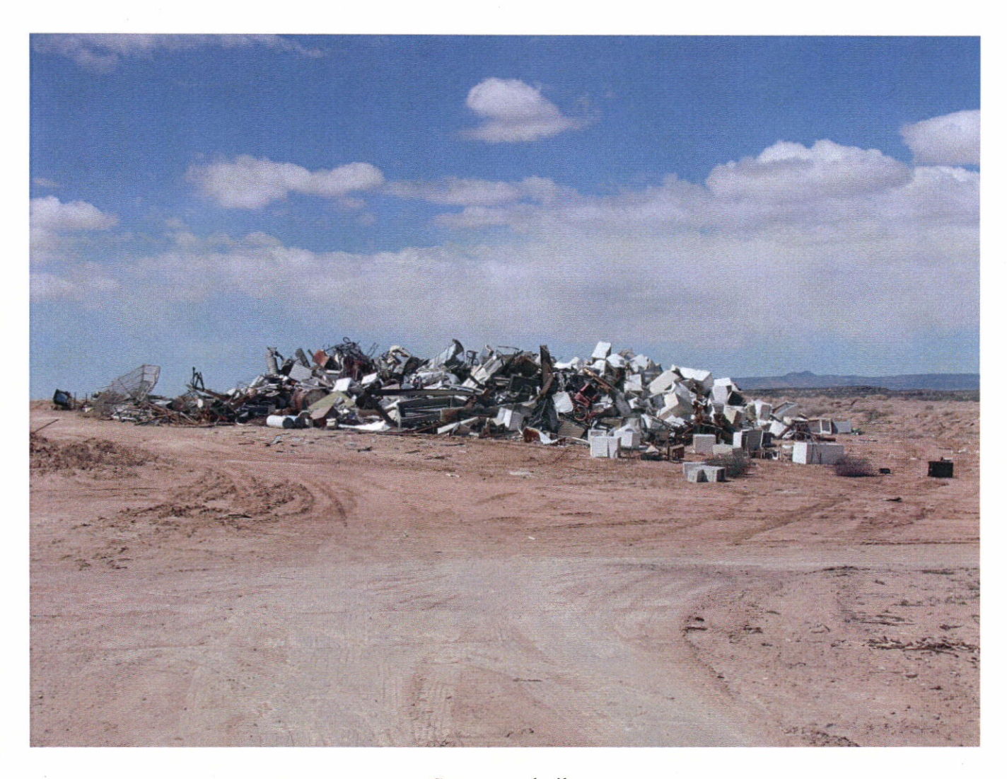
Scrap metal pile